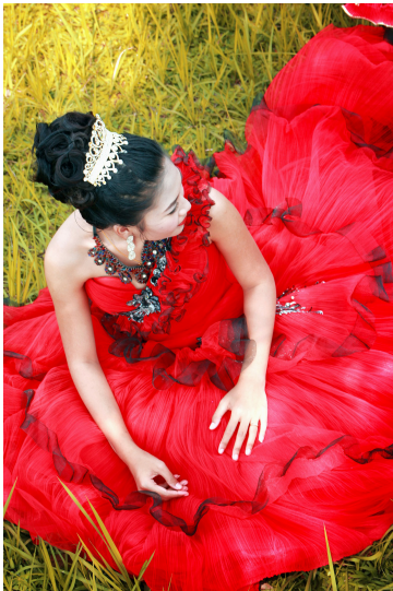
OPEN YOUR IMAGE