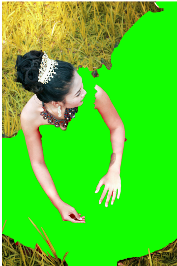
MAKE A NEW LAYER, SELECT THE LAYER & BRUSH YOUR AREA